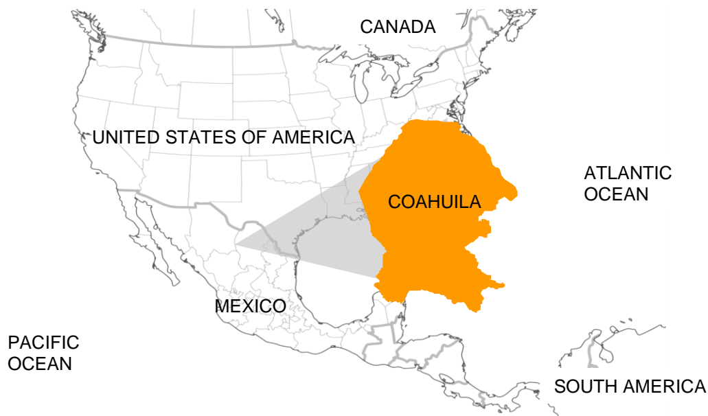
Location of Coahuila de Zaragoza in North America

Coahuila de Zaragoza is the third largest state in the country, located in northeastern Mexico and shares a 512-kilometer border with the U.S. state of Texas. In Mexico it borders the states of Chihuahua, Durango, Zacatecas, San Luis Potosí and Nuevo Leon.