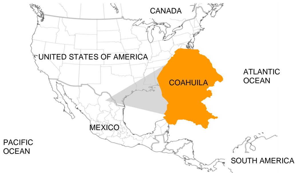
Map 1. Location of Coahuila de Zaragoza in North America

Coahuila de Zaragoza is the third largest state in the country, located in northeastern Mexico and shares a 512-kilometer border with the U.S. state of Texas. In Mexico it borders the states of Chihuahua, Durango, Zacatecas, San Luis Potosí and Nuevo Leon.