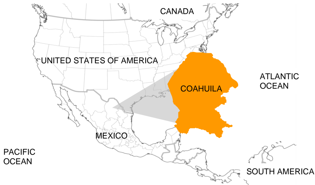
Location of Coahuila de Zaragoza in North America

Coahuila de Zaragoza is the third largest state in the country, located in northeastern Mexico and shares a 512-kilometer border with the U.S. state of Texas. In Mexico it borders the states of Chihuahua, Durango, Zacatecas, San Luis Potosí and Nuevo Leon.